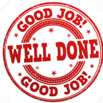
PAW Bucks = Lunch with Principal