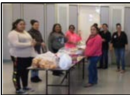
Kinder Thanksgiving Feast