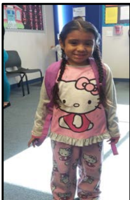
Pajama Day/Fun Friday