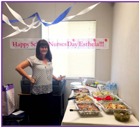
School Nurse Day