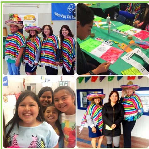
Cinco de Mayo Literacy & Art Fair