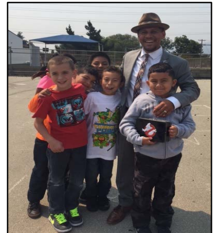
Students at Recess