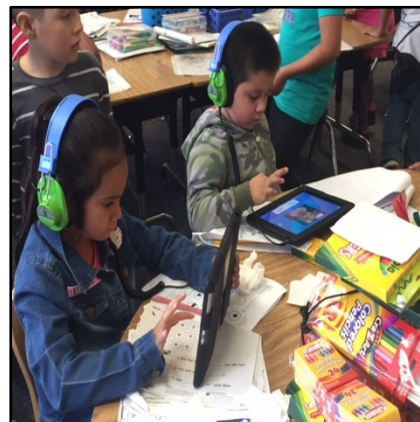
San Vicente Panthers using Technology to learn